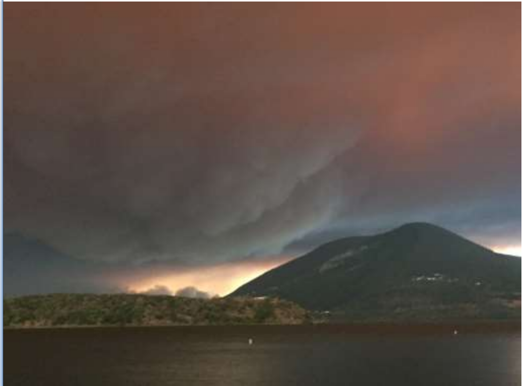
Valley Fire, September 12, 2015 from Kono Tayee Dock